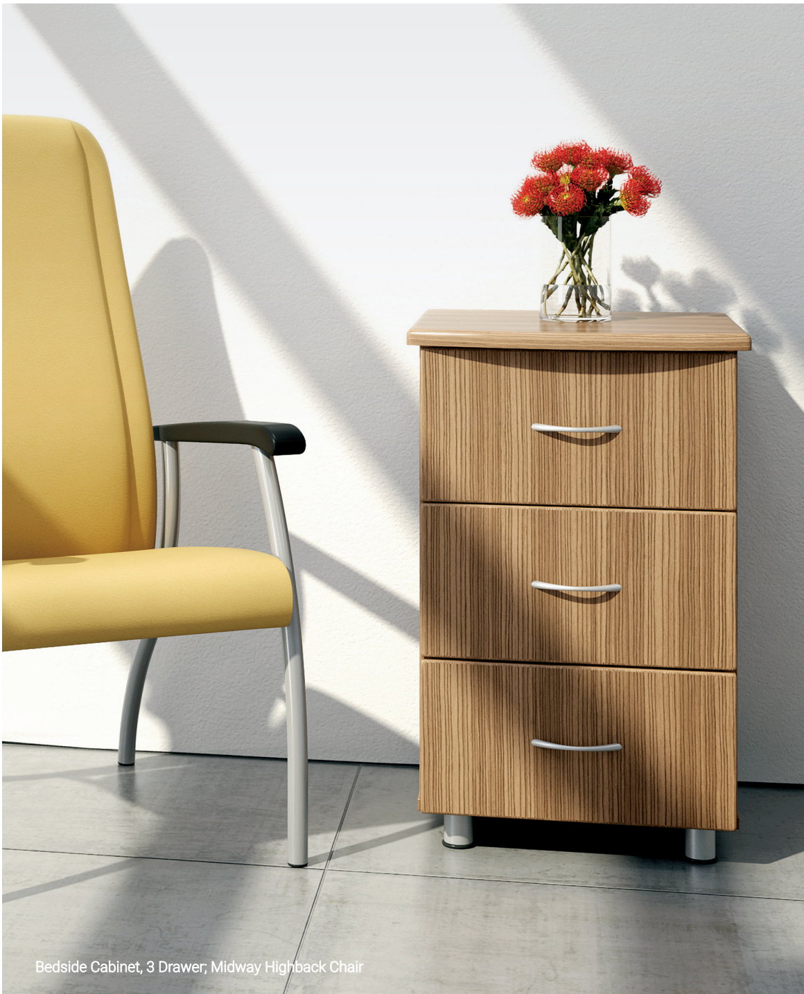
Bedside Cabinet, 3 Drawer; Midway Highback Chair