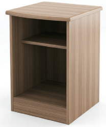
TBCAB-DHD Heavy Duty