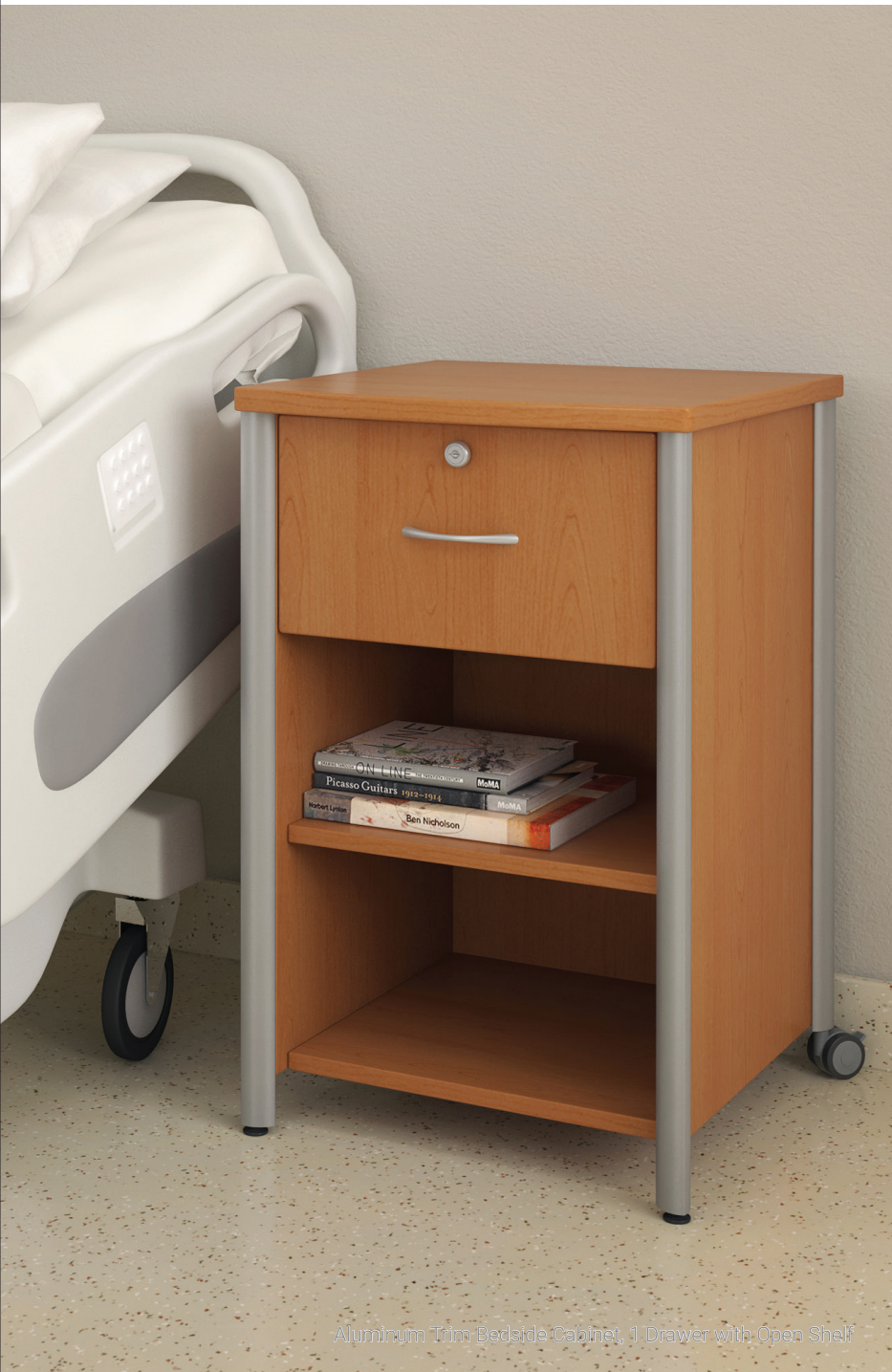
Aluminum Trim Bedside Cabinet, 1 Drawer with Open Shelf

An abundance of finish options and features makes it easy to add style and function to any patient room.