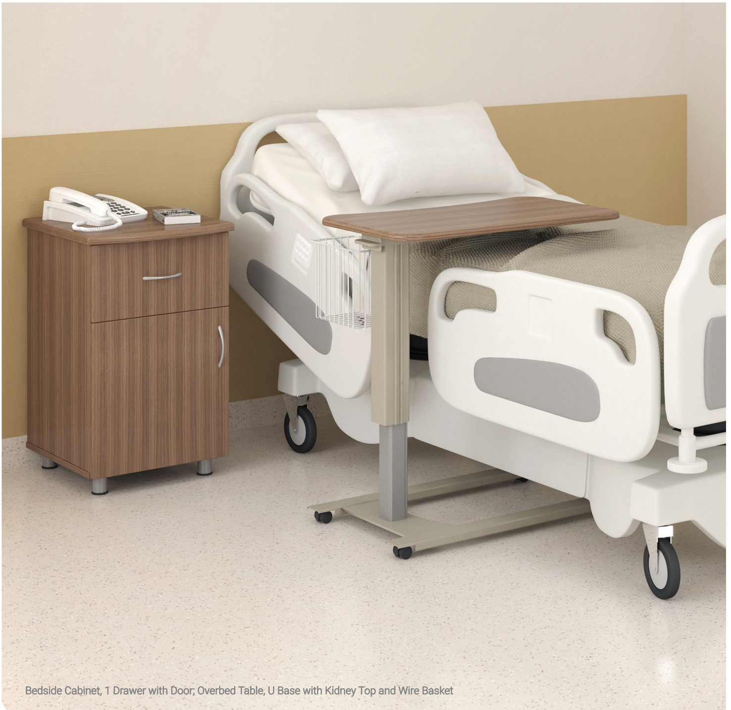
Bedside Cabinet, 1 Drawer with Door; Overbed Table, U Base with Kidney Top and Wire Basket