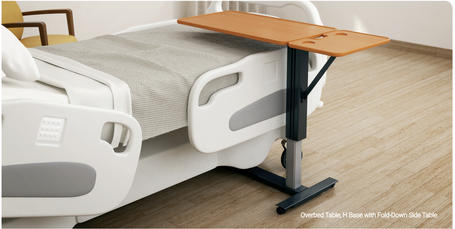
Overbed Table, H Base with Fold-Down Side Table

Overbed tables combine attractive, ergonomic design with infection-resistant features uniquely suited to the healthcare environment. Choose between two low-profile base designs offering complete mobility and height adjustment from 29" to 43".